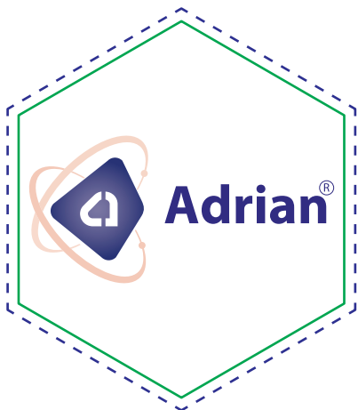
Adrian Kenya Limited